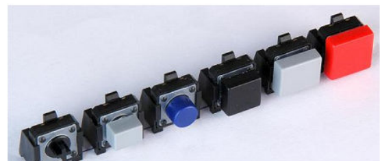
Pran Electronics Pvt. Ltd., India. 12 x 12 mm Vertical tact switches K stem with Knobs Knob sizes: 8x6mm, 7mm dia. round, 10x10mm, 10x12.5mm, 12.5x12.5mm